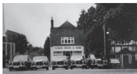
THOMAS BRAGG FUNERAL DIRECTORS