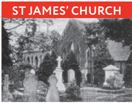
ST JAMES' CHURCH