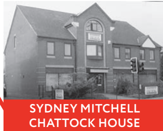
SYDNEY MITCHELL CHATTOCK HOUSE