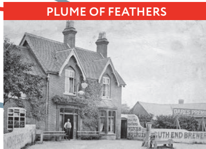
PLUME OF FEATHERS