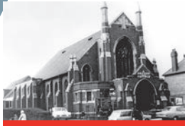
SHIRLEY BAPTIST CHURCH