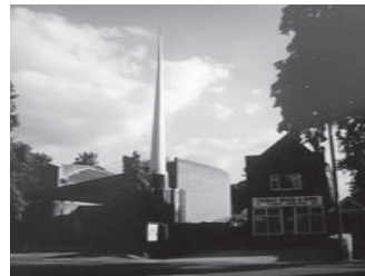
OUR LADY OF THE WAYSIDE CHURCH