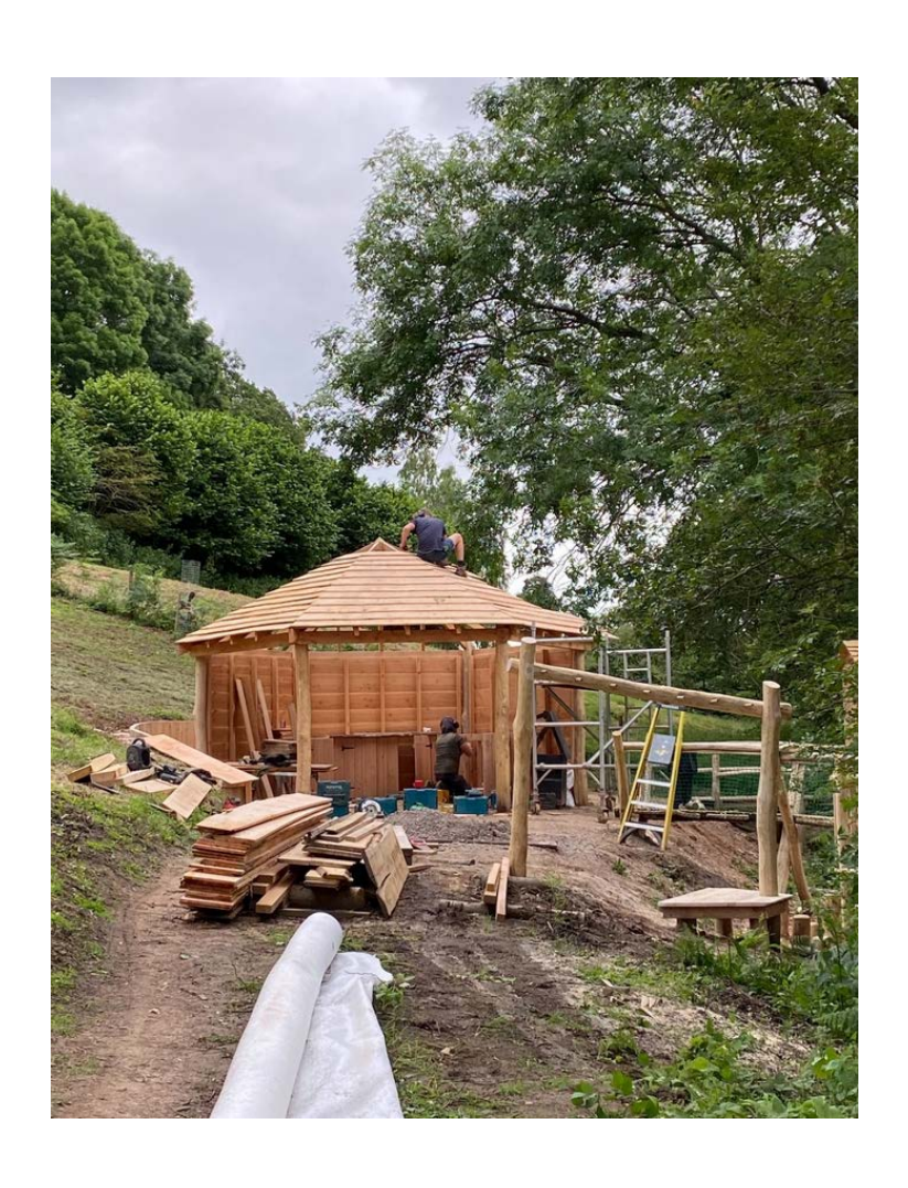
Hexagonal Building Donation