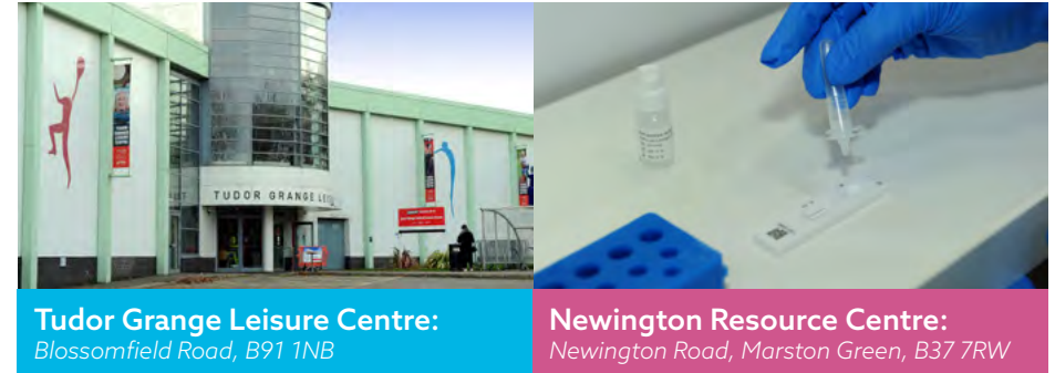
Tudor Grange Leisure Centre: Blossomfield Road, B91 1NB

You need to book an appointment to take a test at one of our community testing centres. No walk-in appointments are available. Tests are available at: