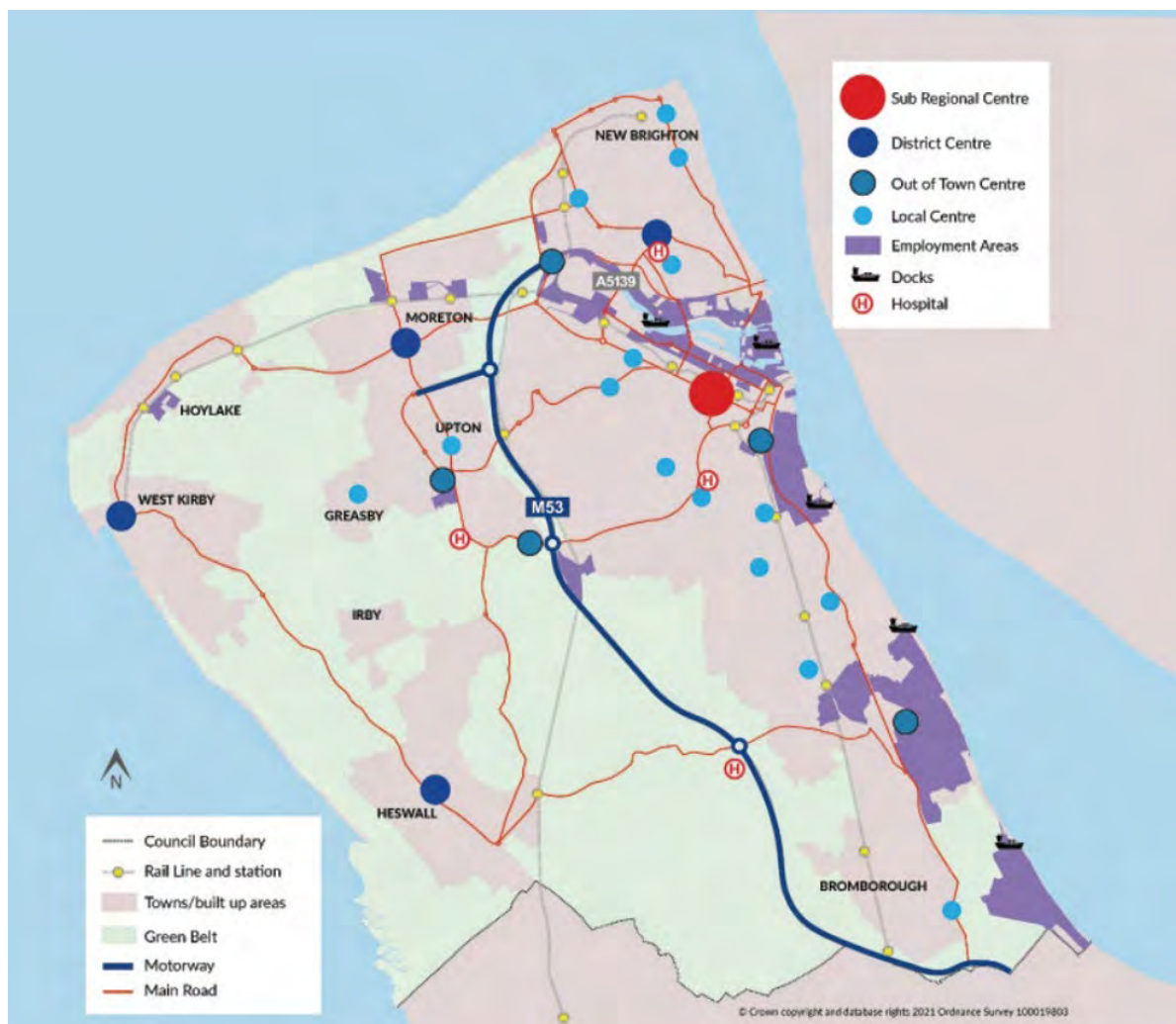
Figure 2.2 form the Wirral Local Plan 2021 – 2037 Draft Submission Plan , May 2022