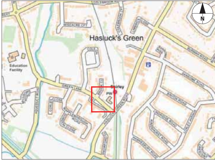
LOCATION PLAN ( N.T.S)