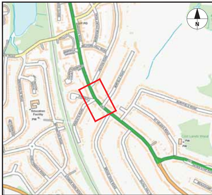
LOCATION MAP (NTS)