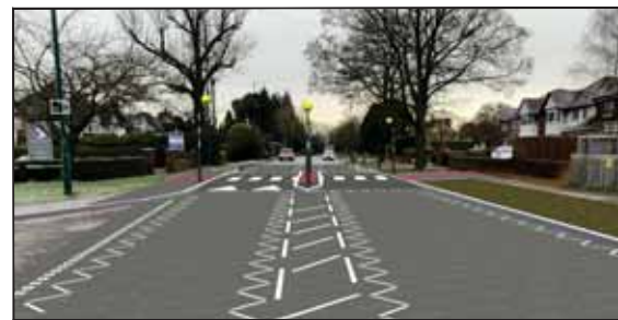
PROPOSED LAYOUT *5