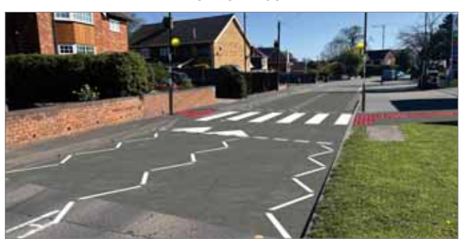
PROPOSED LAYOUT *5