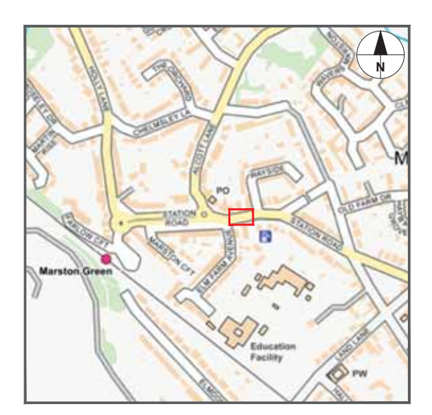
LOCATION PLAN SCALE (N.T.S)