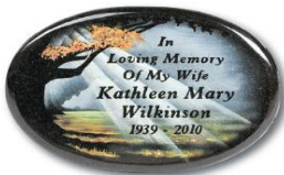
Woodland Walk - 10" x 7"