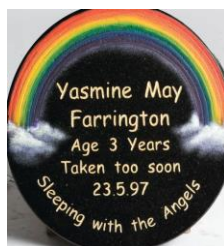
Over the rainbow