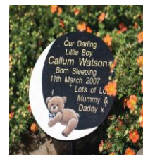
To the Moon and Back