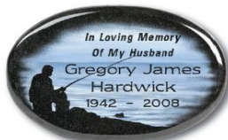
Reflections - 10" x 7"