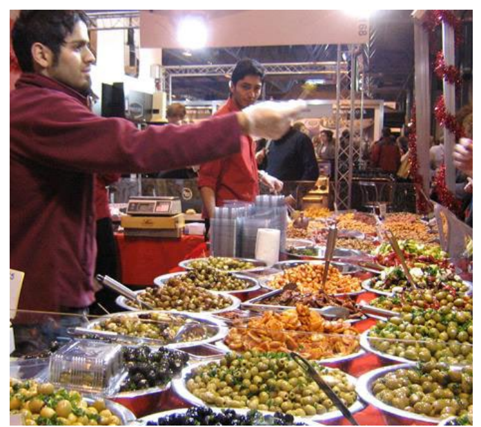
Good Food Show NEC

In Solihull there are 52.7 fast food outlets per 100,000 people, which compares favourably to the England average of 86 (Public Health England 2013). There