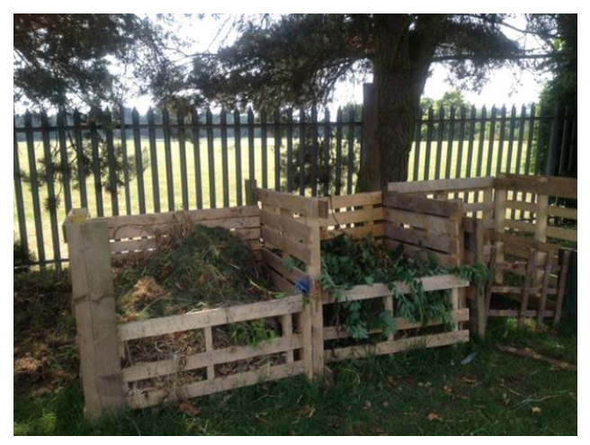
Solihull Neighbourhoods in Bloom, Coppice Junior School

The Foresight Report on the Future of Food and Farming (2011) set out very clearly the challenge of managing a food system at a time of an "unprecedented confluence of pressures". A growing population, alongside the increasing demand for limited resources such as