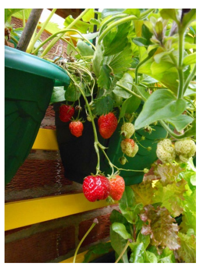
Solihull Neighbourhoods in Bloom -Our Lady of the Wayside