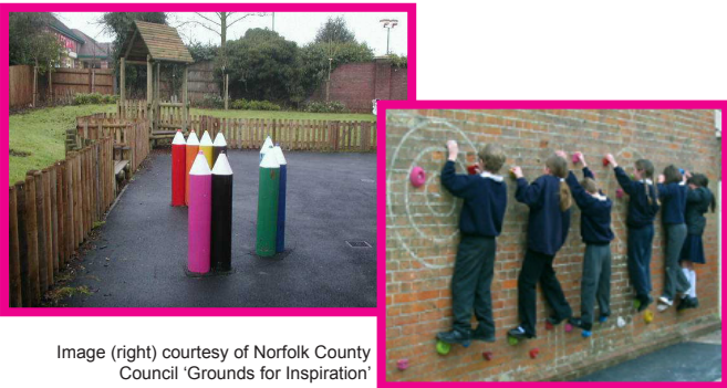
Image (right) courtesy of Norfolk County Council 'Grounds for Inspiration'